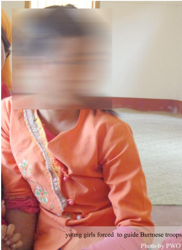
young girls forced to guide Burmese troops