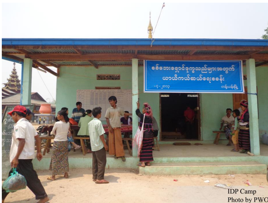
IDP Camp

There are increasing numbers of IDPs in Palaung areas. There were over 2,000 IDPs in Namkhan and Mantong townships at the end of 2012, and there are now over 1,500 IDPs at Tangyan township since March 2013 due to the attacks against the SSA-N and TNLA. There